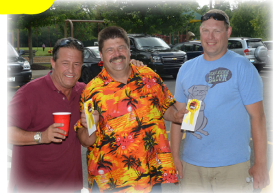
3rd Place - Sanitation