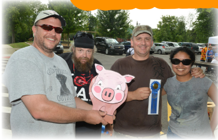
1st Place Tie! Police and Water Dept