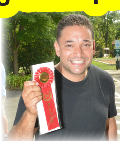
2nd Place - Engineering