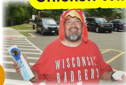
1st Place - Cemetery