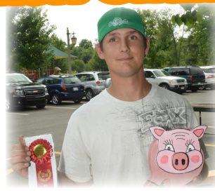
2nd Place - Fleet