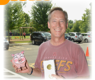
3rd Place - Com Dev