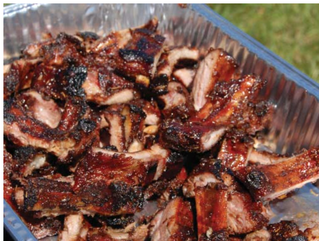
This is a small sampling of the outstanding ribs from the 2011 competition.....