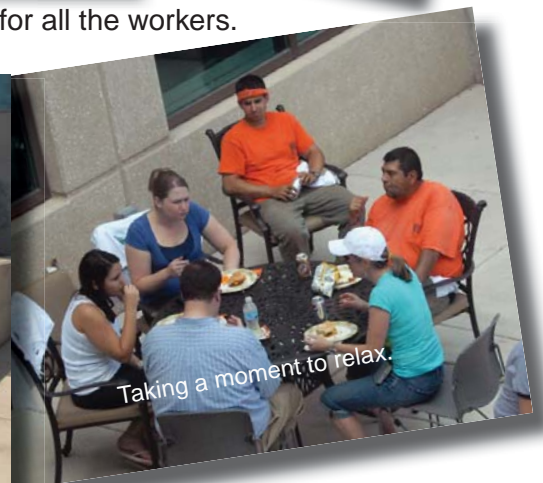
Taking a moment to relax.