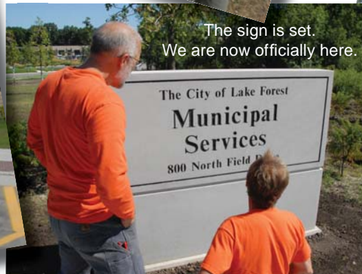
The sign is set. We are now officially here.