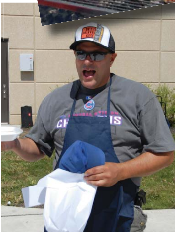
Team ComDev served breakfast to the ribbers