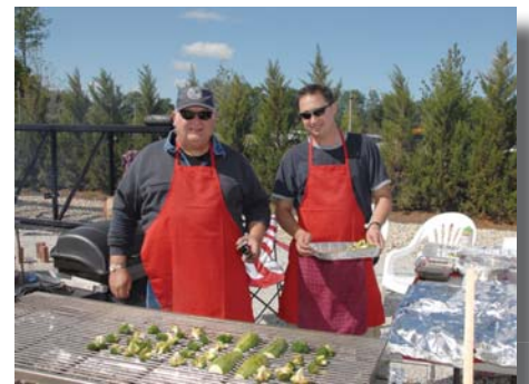
Team Fire took 2nd Place