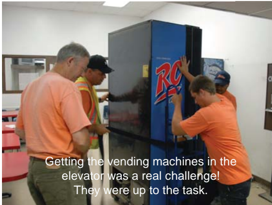
Getting the vending machines in the elevator was a real challenge! They were up to the task.