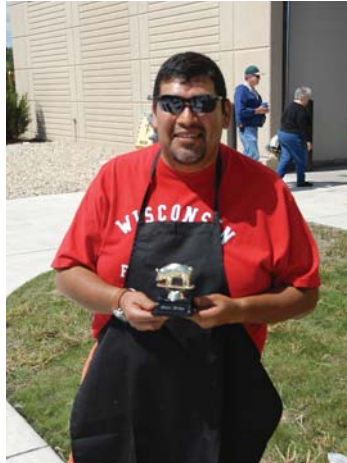
"Ribs to Die For" from Team Cemetery took the trophy!