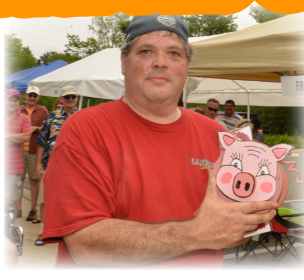
2nd Place - LFTV