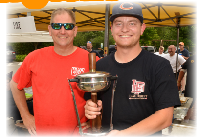
People's Choice - Building Maintenance

Employee Picnic and BBQ Rib Cookoff 2015!