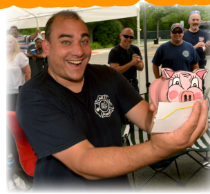
3rd Place - Fire