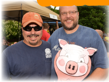
1st Place - Water Utilities