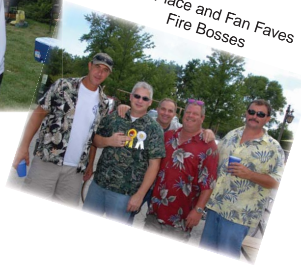
3rd Place and Fan Faves Fire Bosses