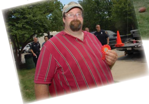
2nd Place - Parks