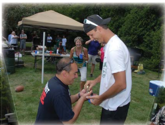
The Winners - Fleet Last year's winner passes the coveted Pig Trophy