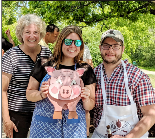
1st Place Finance