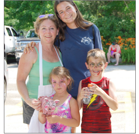
3rd Place CROYA/REC