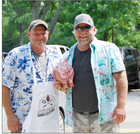
2nd Place ComDev