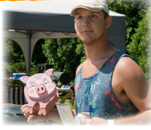
2nd Place - Fleet