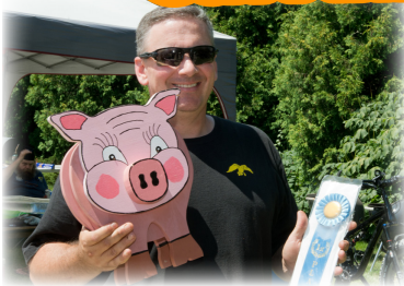
1st Place - Police