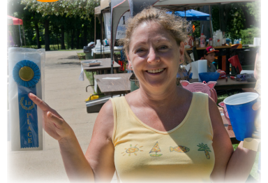
People's Choice - Recreation

Employee Picnic and BBQ Rib Cookoff 2016!