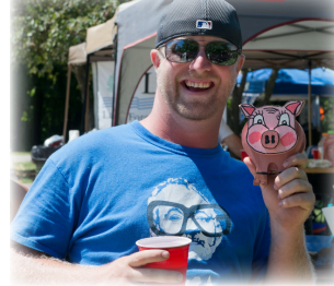
3rd Place - Parks